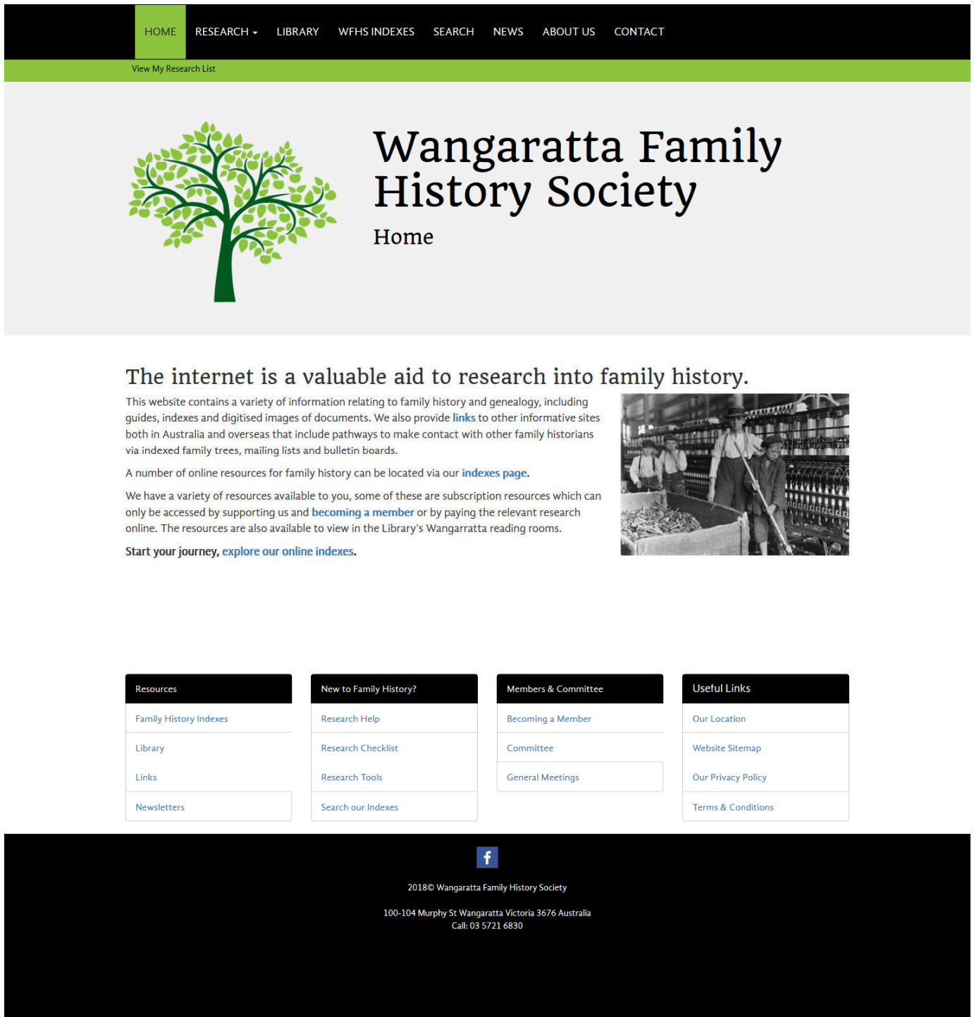
Above: Screenshot of the Home page for the new WFHS Inc. website.