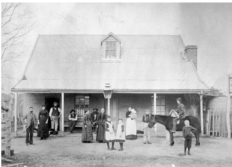
Above - The Oxley Hotel, Oxley circa 1885.