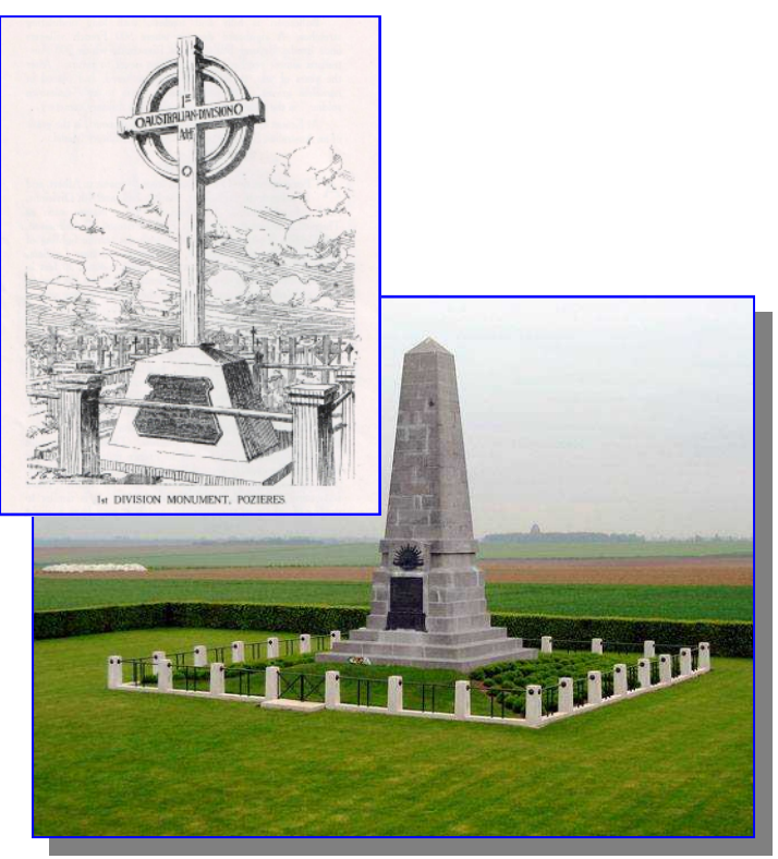
The First Division Memorial, Pozières. The top of the Thiepval Memorial to the Missing of the Somme can be seen above the trees in the distance.

Because all Australians demanded to know what was being done to bury and memorialise those WWI soldiers who died in the battlefields in foreign lands, the Australian Minister of State for Defence published the above book in 1920. A copy is held in our library. There are many illustrations of memorials erected in the battlefields soon after the end of WWI, and two examples with a picture of how those memorials now look follow: