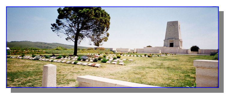
Cemetery at Lone Pine Gallipoli.