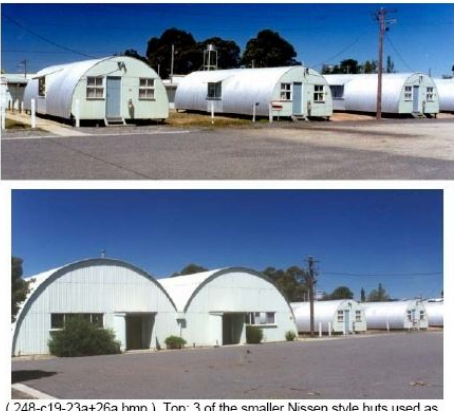
48-c19-23a+26a.bmp) Top: 3 of the smaller Nissen style huts used as Jormitories. Bottom: The 2 large Nissen style huts used for soldiers' amenities