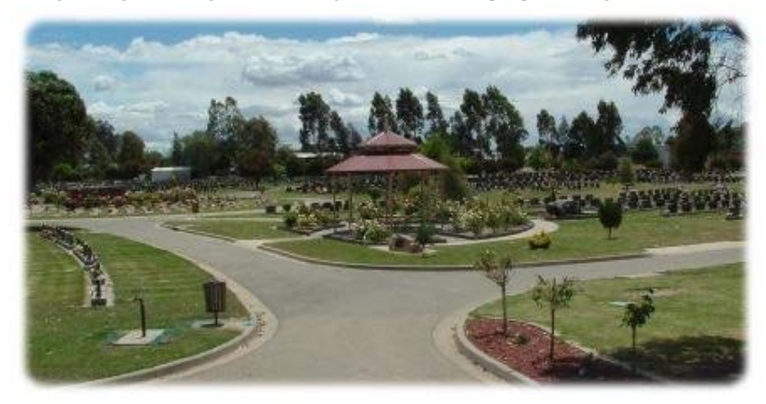
The Mercury (Hobart, Tasmania) Monday 10 January 1898

Intercolonial Telegram: from Melbourne papers - Victoria - Wangaratta January 6