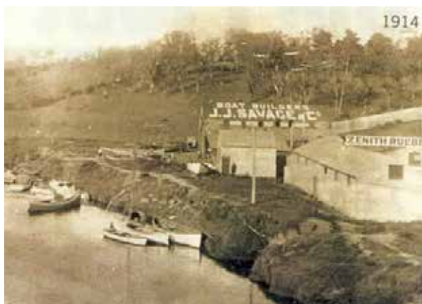
J.J. Savage & Co 1914

This photo, showing the premises of J.J. Savage & Co., boat builders, was taken from the Church Street Bridge. The boat builders were located on the south bank of the Yarra, east of the Church Street bridge. Adjacent to the boatworks is the Zenith Rubber Mills. The photo was donated to the Stonnington History Centre by J.J. Savage & Sons (Aust) Pty. Ltd, boat builders since 1898.