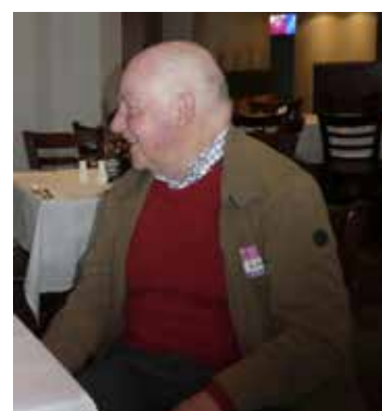
The Society would like to thank the Malvern Vale Hotel for providing the venue for the Malvern Historical Society 50+ Years morning tea