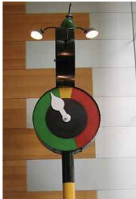
Marshalite Traffic Control Signal Melbourne 1940-1960

Did you know you can view our Facebook posts on our website Home Page? http://home.vicnet.net.au/~malvern/