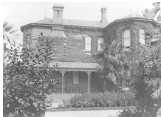
Doona, Glenferrie Road, Toorak c1886