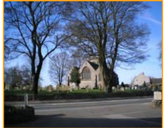
Parish Church, Peak Forest